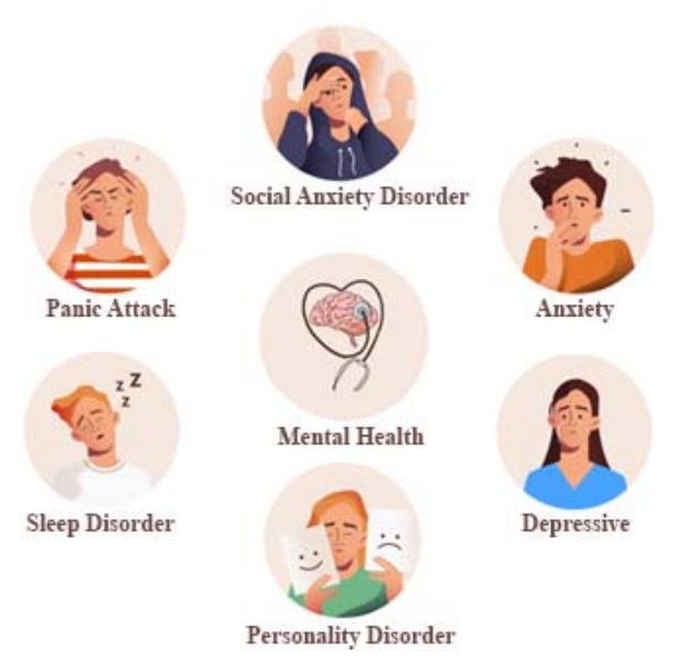
Figure 1.The implications of stress in daily life during the COVID-19 pandemic.

have imposed damage to the spectrum of individual health.