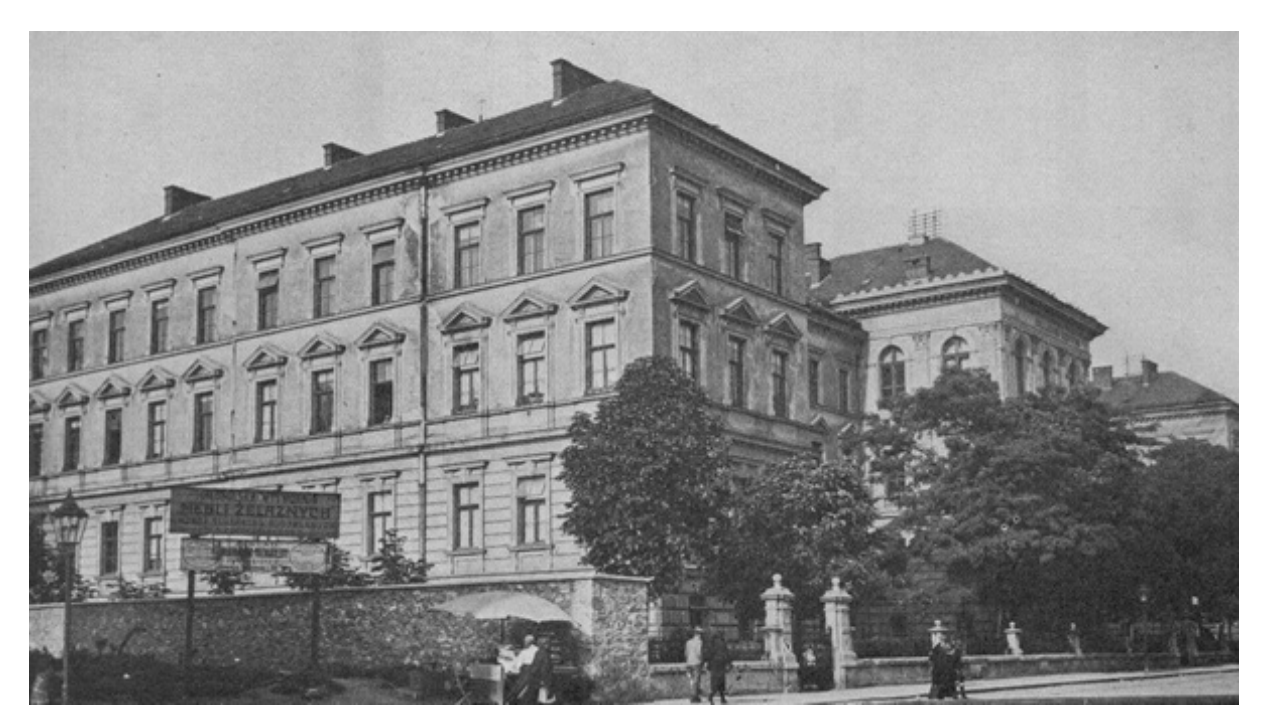
The Institute of Legal Medicine from Krakow