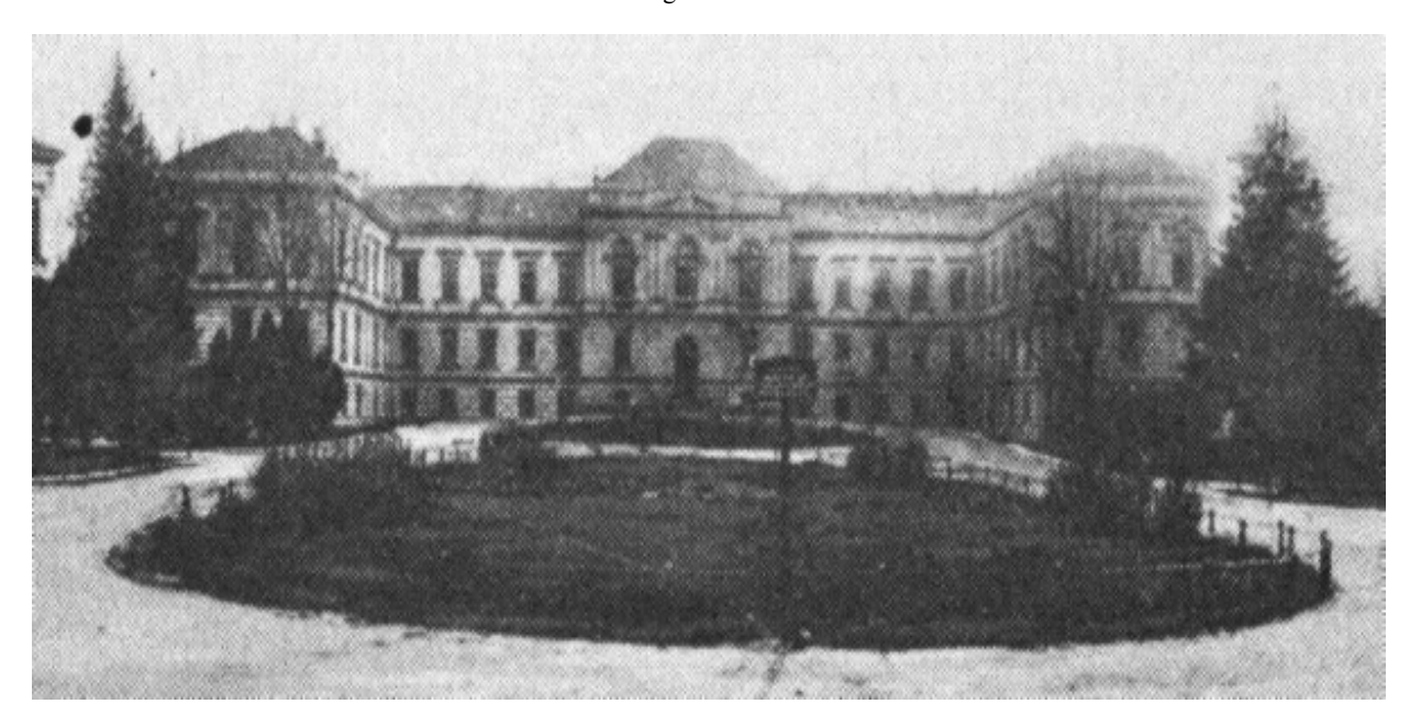
The Institute of Legal Medicine from Lvow

For example the component parts of the Institute of Bucharest included at that time: rooms for the exposition and preservation of cadavers by means of refrigerating apparatus; an autopsy room; photographic rooms: for the cadavers, and for living people where lesions and deformities are photographed; a laboratory of toxicological chemistry where analysis is made of the organs taken from the cadavers of people supposed to have been poisoned; a laboratory for microscopy; radiograph equipment room; equipment for physiological experiments; a laboratory of pathological anatomy; a museum containing anatomical specimens and instruments which have been used in the perpetration of crimes and suicides; a library; an amphitheater for students; and a chapel for bodies before their interment. All the institutes included rooms for teaching purposes, mainly at the Chair of Legal Medicine as a part of the Faculty of Medicine in the East European cities.