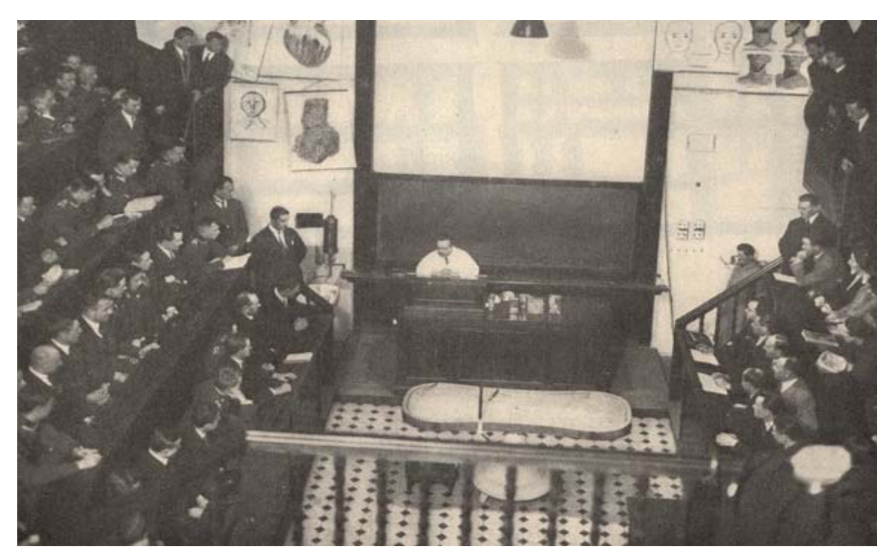
The Institute of Legal Medicine from Warsaw (auditorium)