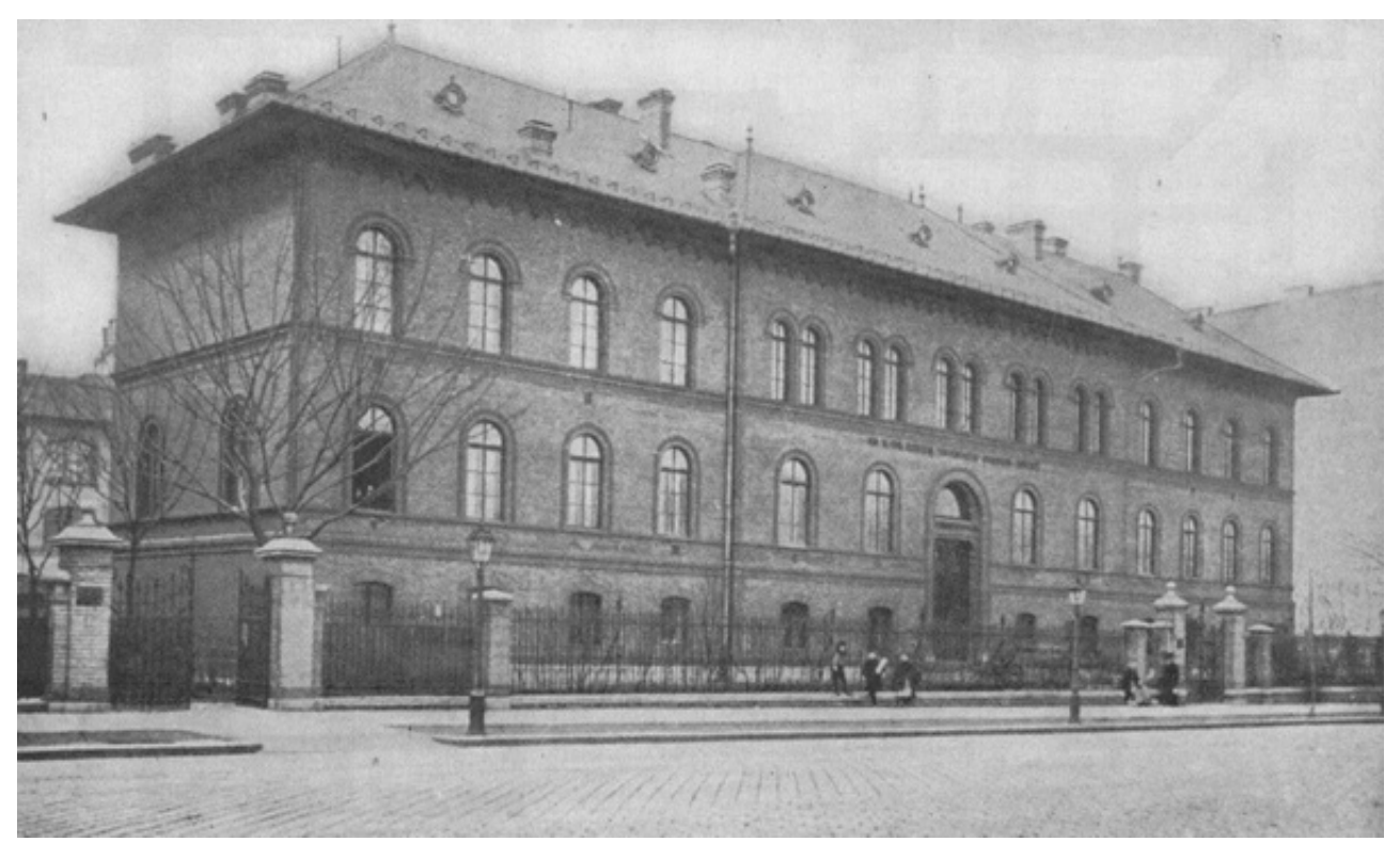
The Institute of Legal Medicine from Budapest

In view of the training required for doctors toward legal medicine, all the Eastern European Institutes have created an organization both for the utilization of teaching material and for wider forensic research.