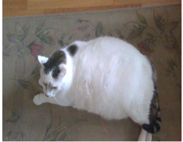
Fig. 3. Feline, European breed, spayed male – overweight, type I diabetes.