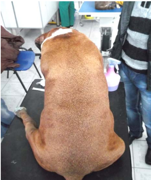
Fig. 2. Canine, German Boxer breed, 10 years old, unspayed female – obesity, type I diabetes, arthritis and mammary tumors.