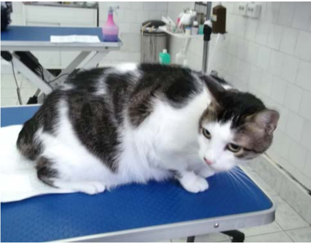
Fig. 1. Feline, European breed, 8 years old, spayed female – with obesity and type II diabetes.