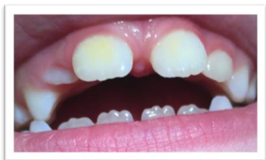
Figure 4. Diastema between the two upper permanent central incisors

Dental anomalies were found in front teeth, in both dentition and were determined only in shape dental anomalies. One fusion and one gemination were found, their frequency representing 0.4% of the total of 226 pupils examined. The frequency determined in this study fall under the frequencies reported in the specialty literature for this type of dental developmental anomalies. Our values are similar to those reported by Lochib, Wangrimongkol and Hamasha and col. 4-6 and close to that reported by Sekerci and col. that found a frequency of 0.38% in their study at a Turkish university 12 .