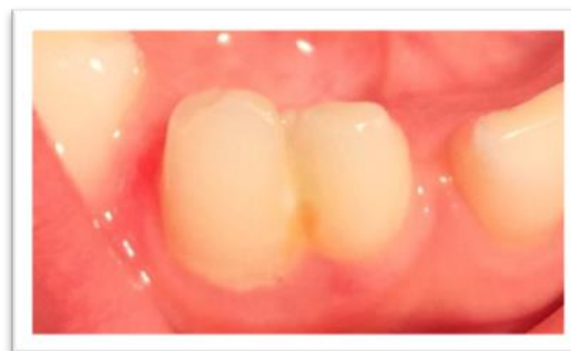
Figure 2. Fused teeth 8.2 and 8.3

In two children (0.44% of the total of pupils examined), dental developmental anomalies were clinically found: one fusion between lower primary lateral incisor and canin – 8.2 and 8.3 (Figure 2) and one gemination of upper right permanent central incisor – 1.1. (Figure 3).