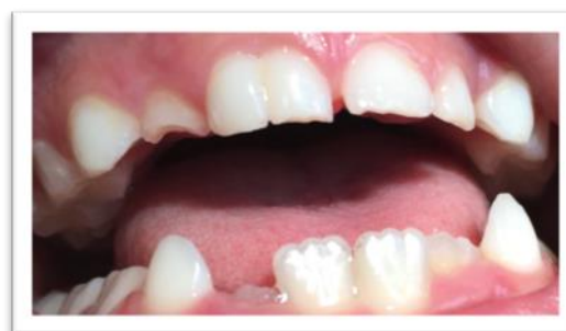
Figure 3. Gemination of 1.1

In nine children (3.98% of the total of pupils examined), diastemas were observed. Diastema was present at 7 girls (6.54% of the girls) and at 2 boys (1.68% of the boys). The mean age of children with diastema was 7 years and 3 months. Diastema was found in permanent dentition, between the two upper central incisors (Figure 4).