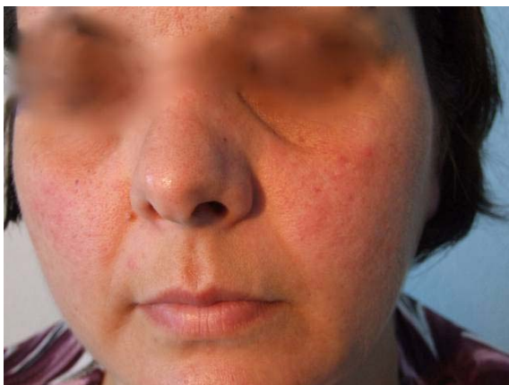
Fig. 5. Case 3 before treatment.