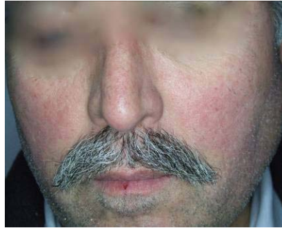
Fig. 2. Case 1 at 6 months after treatment.