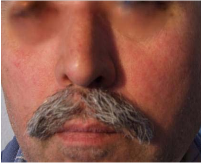
Fig. 1. Case 1 before treatment.