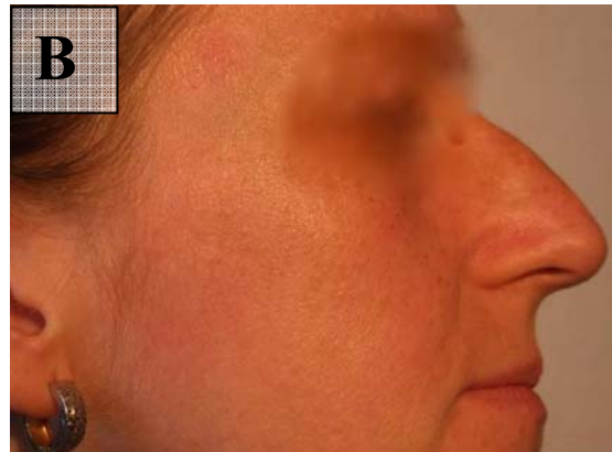
Fig. 4. A) Case 2 right profile before treatment, B) Case 2 right profile after treatment, C) Case 2 before treatment full face, D) Case 2 full face after treatment.