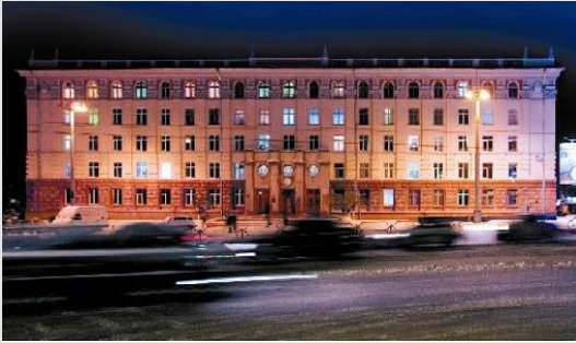
Academy of Sciences of Moldova